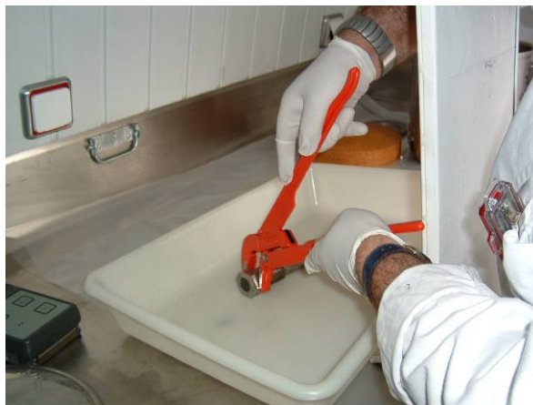
Figure 1 Removal of an Am-Be source keeping inside a Cs-137 source of a density and moisture measurement equipment.

In some cases ENRESA has to remove from the equipment the source together with its shielding or remove the source from the shielding to transport it in a suitable transport container (figure 1). In general, only alpha sources are removed from their shielding using conventional methods.