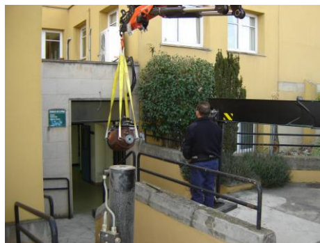
Figure 2 Removal of the head of a teletherapy equipment with Co-60 source.