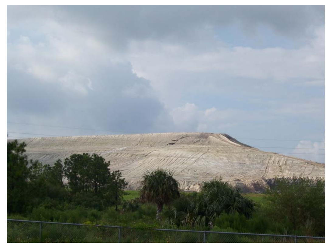
Figure 2. Phosphogypsum stacked on land.

Since phosphogypsum is a useful material, it is reasonable to explore the risks and benefits associated with its use so that alternatives to stacking are fully considered. Under the existing and influential US EPA rules, phosphogypsum is assumed to continue being seen primarily as a waste rather than for its potential beneficial reuse. The "waste" designation encourages the development of stacks as the status quo until future uses are accepted instead of initiating immediate uses for phosphogypsum. Unless the framework driving the management of stacks is updated, stacks are expected to continue creating their own unique environmental concerns in existing locations, and also in many newly producing locations around the globe such as Eastern Europe, India, China, the Middle East and North Africa.